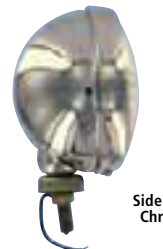
Side View Chrome