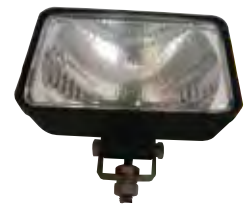
725062 / *725082