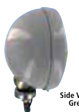
Side View Grey