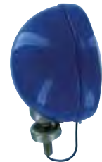
Side View Blue