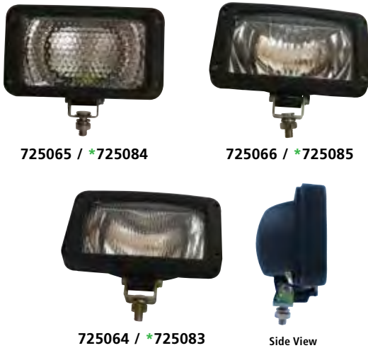
725065 / *725084

These lamps contain a highly polished reflector, manufactured using high heat and vacuum formation. The lamp housing is a durable and rugged nylon composition. The steel plated mounting bracket is fully adjustable for any suitable location.