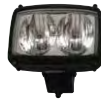
725074 / *725075