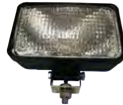
725061 / *725081