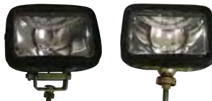
725527 / *725540