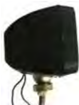
Side View Swivel Mount