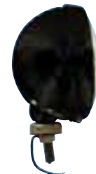
Side View Black

*MORE "PAR 46" SEALED BEAMS ARE FOUND ON PAGE 109.