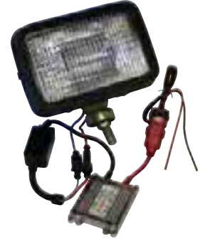
*726015 / *726019