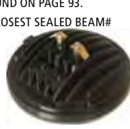
Back View – 735434 / 735435