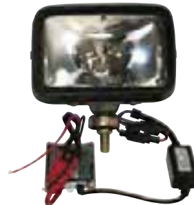
*726016 / *726020