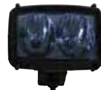
*725076 / *725077