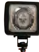
*725097 / *725098