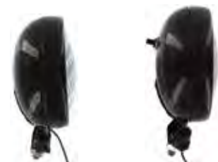
Side View – No Switch