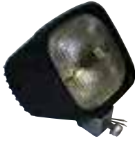
*726022 / *726023