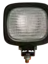
*725095 / *725096