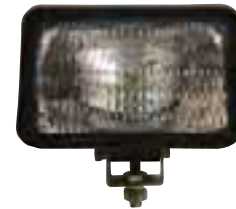
725060 / *725080