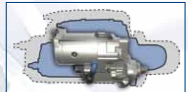
IIF Starter P5.0 Starter

Contact Your DENSO Sales Rep Or Visit www.DensoHeavyDuty.com For Updated Application Information