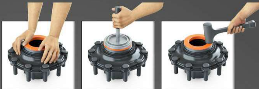
FLIP THE TOOL PLATE OVER

No more searching for the right tool. Use any flat object to install the RevHD seal.